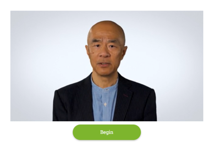
Figure 3. Avatar interface for the POA-EI

From a general perspective, the tests benefit several populations, contribute to the appropriate management of infrastructure, human and financial resources (i.e. virtual vs. in-person applications, and linear vs. adaptive nature of tests), and present a more-user friendly interface (see Figure 3). Additionally, by training AI and incorporating it into diagnostic assessment processes, PELEx is also pioneering in the field of AI in Latin America, collecting relevant information for improving test design, administration, interpretation, analysis and use in the region and positively adding to the understanding of the Costa Rican's students levels of proficiency in different languages.