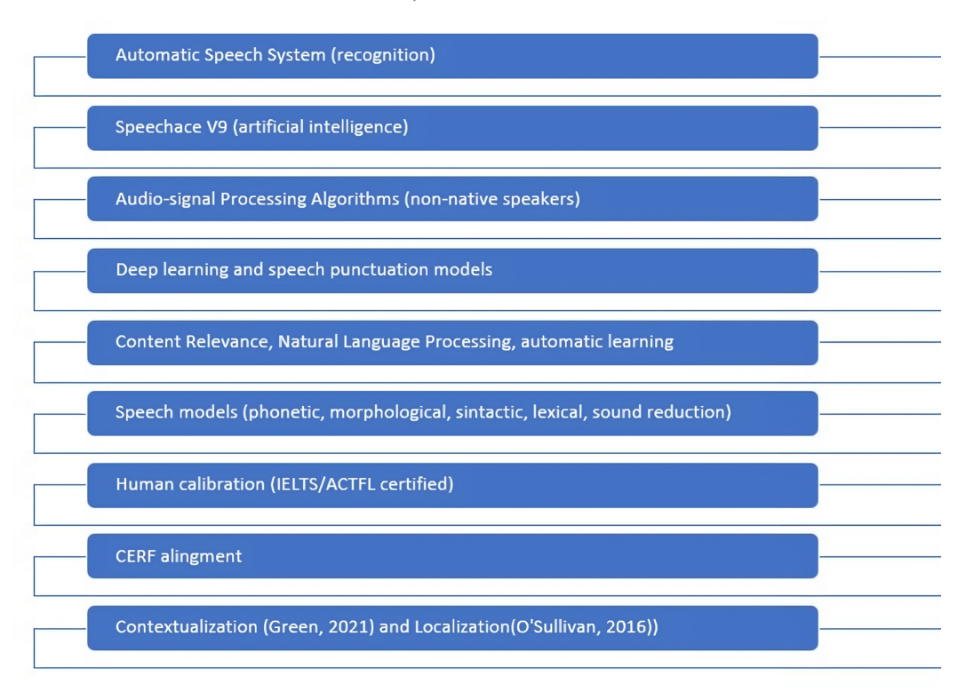
Figure 2. Features, General Components and Principles of the POA-EI at PELEx

According to PELEx (n.d), the POA-EI intends to measure the oral expression and production skills on national, regional, and global topics within the CEFR interpersonal domain through descriptions, presentations, narrations and argumentations. The oral production is assessed in one-way exchanges (monologues) with an avatar by audio recording the test taker's contributions in a computer. The topics and themes to orally express about are selected according to the CEFR and the target population's needs. Furthermore, coherence is reached through the use of the CEFR's descriptors in order to interpret the test takers' speech punctuations, which correspond to a specific level of proficiency (i.e. A1, A1+, B1, B1+, B2, B2+, and C1).